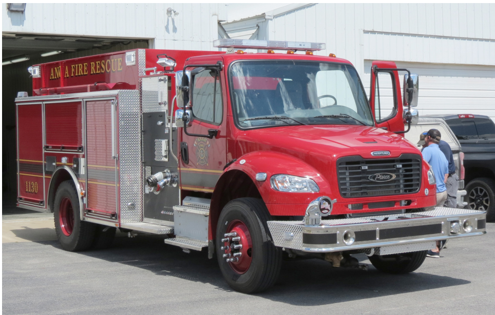
New vehicle delivered A new vehicle was delivered to the Anna Fire & Rescue station last Saturday afternoon.