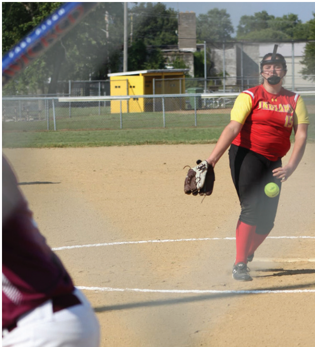
Anna Junior High School softball action.