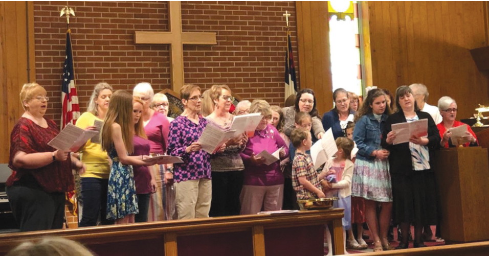
The Ladies of United Methodist Church Anna sang "What a Wonderful World" Sunday morning for Mother's Day.