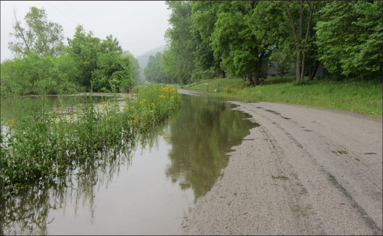
Here we go again...water was over part of the Old Cape Road between Jonesboro and Reynoldsville last Saturday morning. At the time the photograph was taken, light rain was falling.